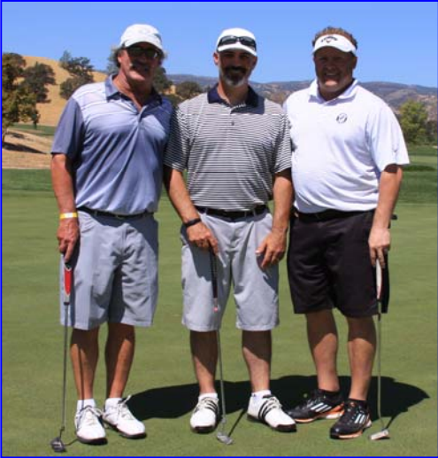
First Place Team — Kiewit

Coincidentally, Parsons sponsored the Hole in One Hole! The company also donated Giants tickets, generating $500 at the auction.